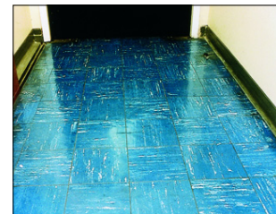
Asbestos-containing floor tiles